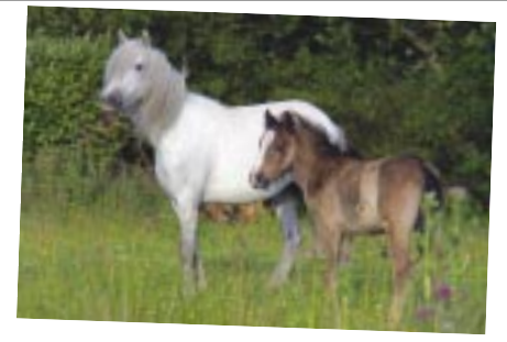
SPI. Greeting Cards featuring Sugar and Spice ideal for birthday or general greeting cards Blank inside for your own message (8" x 6") with envelopes Pack of 6 cards in 6 designs £1.95