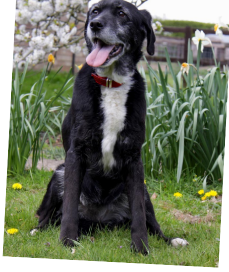
Rehomed - Cassie, at 15 years, an adorable 'golden oldie' with a lovely temperament.