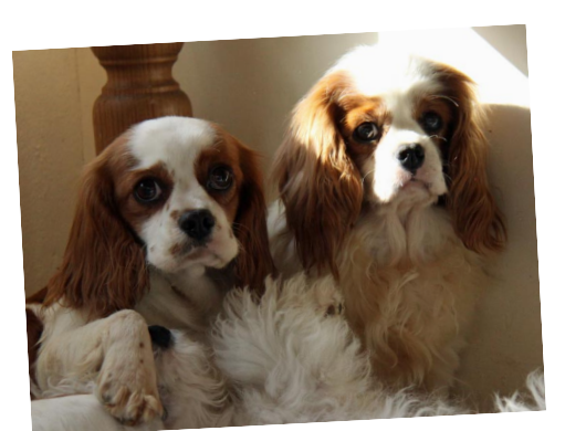
Shy, ex-breeding bitches, Poppy and Petal, have now found a loving home together.

We will care for ALL our rescued dogs until we can find them a suitable home.