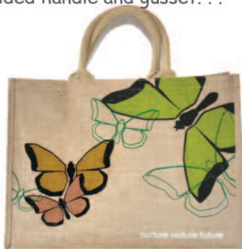
2A. Natural Butterfly Bag Large 2B. Natural Butterfly Bag Small