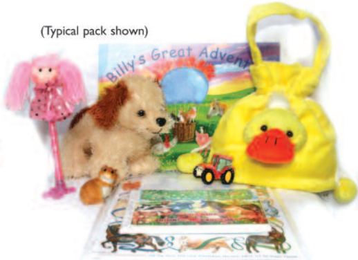
(Typical pack shown)

S32. Dog Back Bags Choose from Sooty or Ginger £4.95