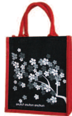
4B. White Flower Bag available in Small only

Designed to be used as a re-usable and stylish alternative to plastic bags which are continually adding to the decline of our environment. They are made from sustainable and naturally renewable plant fibres called jute, which produces a plain weave cloth noted for its strength and durability. The bags are water resistant and entirely biodegradable.