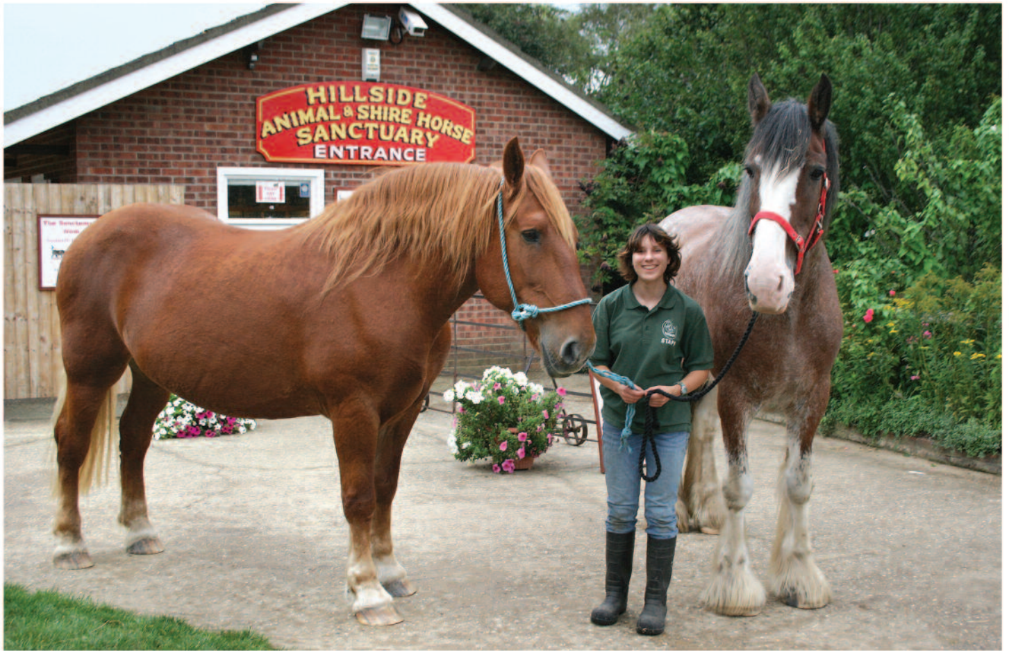
With the help of our supporters, we were pleased to be able to give Ginny, an elderly Suffolk mare, and Bobby the Clydesdale, a permanent home when Hillside took over 'The Norfolk Shire Horse Centre' at West Runton in February 2008.