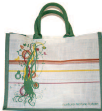
3A. Swirl Bag Large 3B. Swirl Bag Small