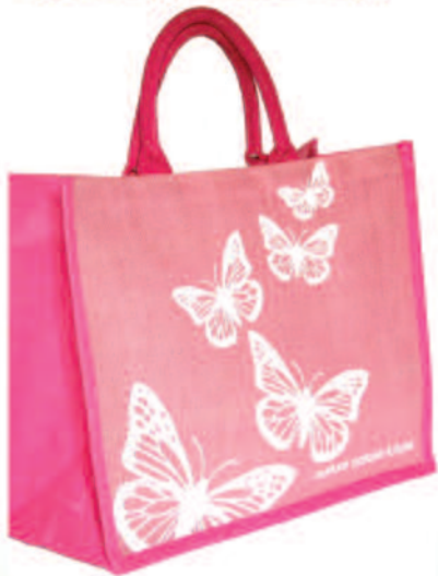
1A. Pink Butterfly Bag Large 1B. Pink Butterfly Bag Small