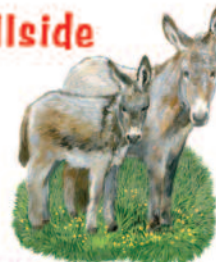
*Dancer & Prancer