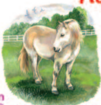
*Katy the Pony