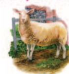
*Starlight the Sheep