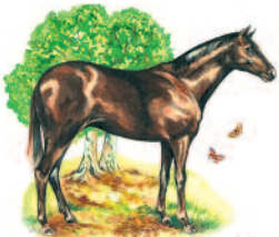
*La Vizelle an ex-Racehorse