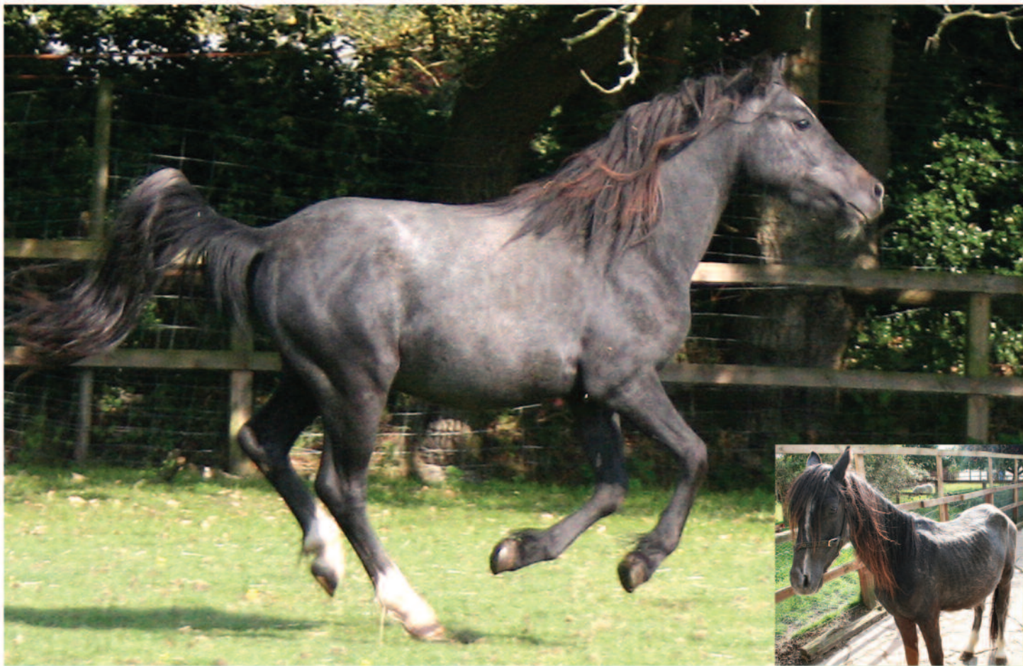
Casper enjoying life at Hillside after just a few weeks of basic feed and loving care following his rescue from a life of neglect.