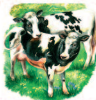
*Bluebell with Pixie