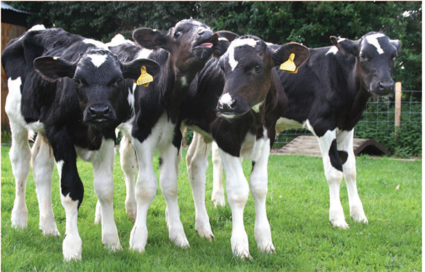
Rescued to be free - Neptune, Jupiter, Saturn and Mars at Hillside. Around 482,000 male dairy calves are born in the UK each year who are either killed shortly after birth or exported to continental veal farms.