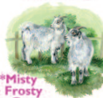
*Misty & Frosty the Goats

Last 3 digits on signature strip on reverse of card