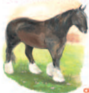
*William Shire Horse