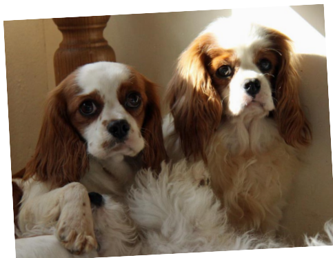
Shy, ex-breeding bitches, Poppy and Petal, have now found a loving home together.

We will care for ALL our rescued dogs until we can find them a suitable home.